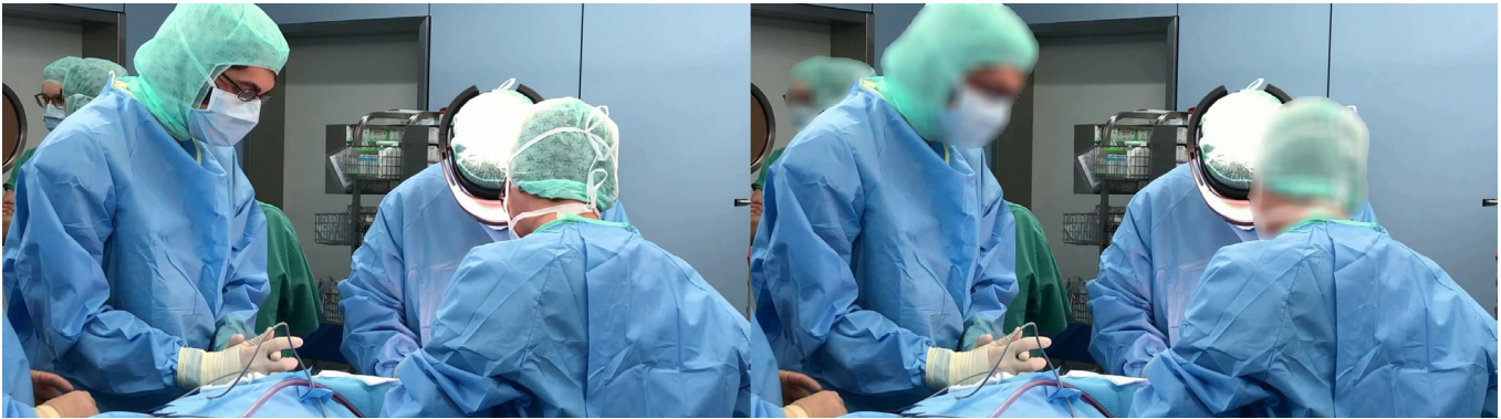
Figure 1. Input (left) and anonymized output (right) of Mask-RCNN.